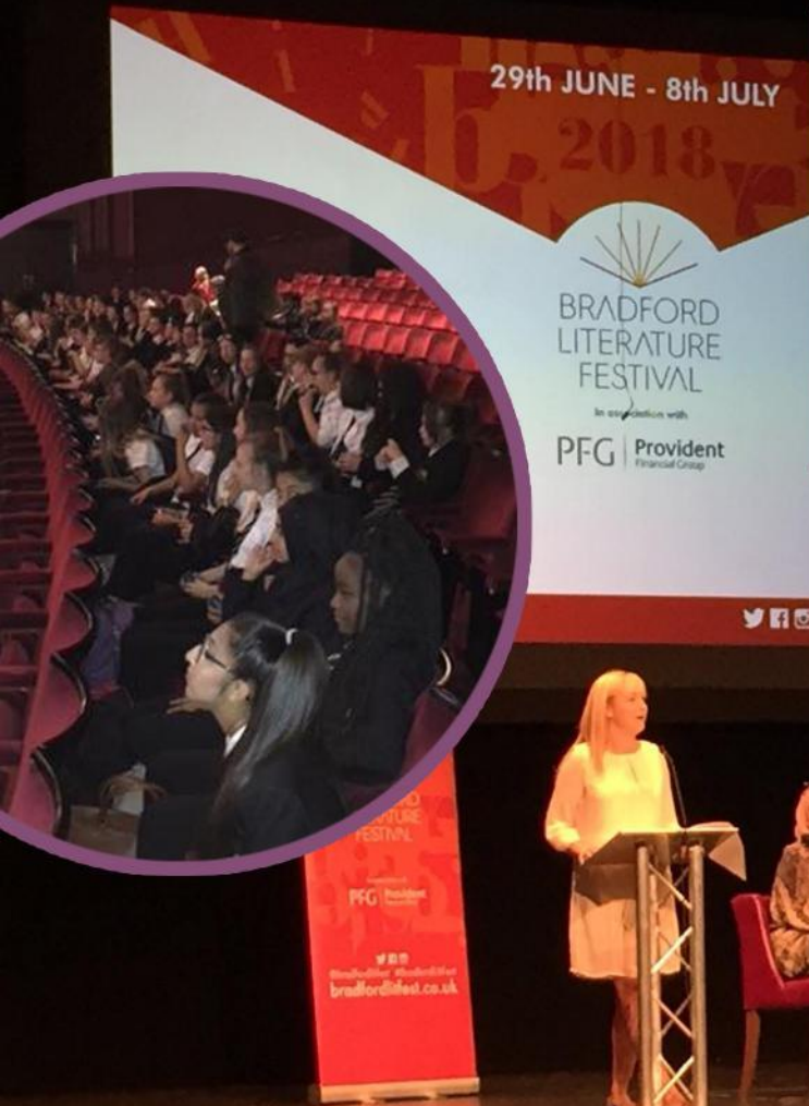
This year's Bradford Literature Festival Schools Programme invited our Year 9 students to a poetry writing event on Thursday 5th July. The group listened to professional poets before writing their own and performing them on the Alhambra Theatre's iconic stage. Our students were a credit to our school and staff were amazed at our students' creativity and confidence at performing in front of a large crowd. A good day had by all!