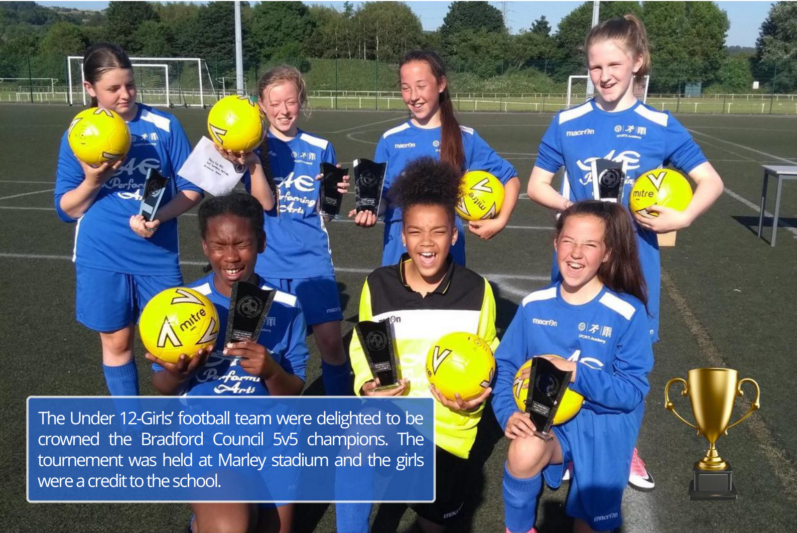
The Under 12-Girls' football team were delighted to be crowned the Bradford Council 5v5 champions. The tournament was held at Marley stadium and the girls were a credit to the school.