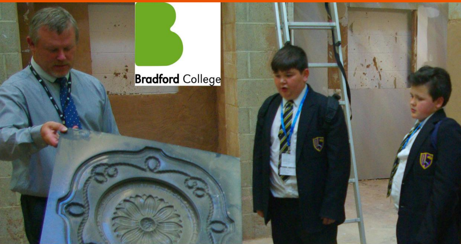
This month, the Year 7 students explored their plans for the future on a visit to Bradford College. Spending the day at the college as part of the MY BC project, the Year 7 students worked alongside their peers from the other BDAT schools to gain an insight into career sectors and learning pathways. With a theme of "Broadening Horizons and Employability" they participated in workshops focusing on a diverse range of career options including working within Health, Engineering and Law. The students were also given a guided tour of the fantastic facilities at the college, which include a dental studio and Performing Arts spaces. This successful venture was made possible by the collaboration of Bradford College and BDAT staff, and was supported by the Broadway Shopping Centre. With over a thousand students taking part over the two days it is hoped that this experience can become an annual event.