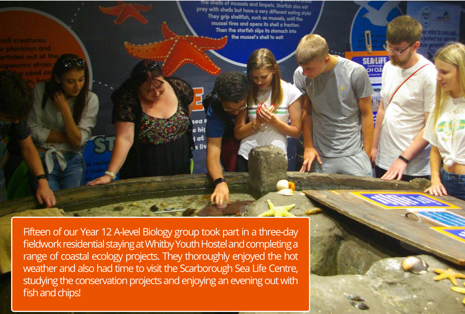
Fifteen of our Year 12 A-level Biology group took part in a three-day fieldwork residential staying at Whitby Youth Hostel and completing a range of coastal ecology projects. They thoroughly enjoyed the hot weather and also had time to visit the Scarborough Sea Life Centre, studying the conservation projects and enjoying an evening out with fish and chips!