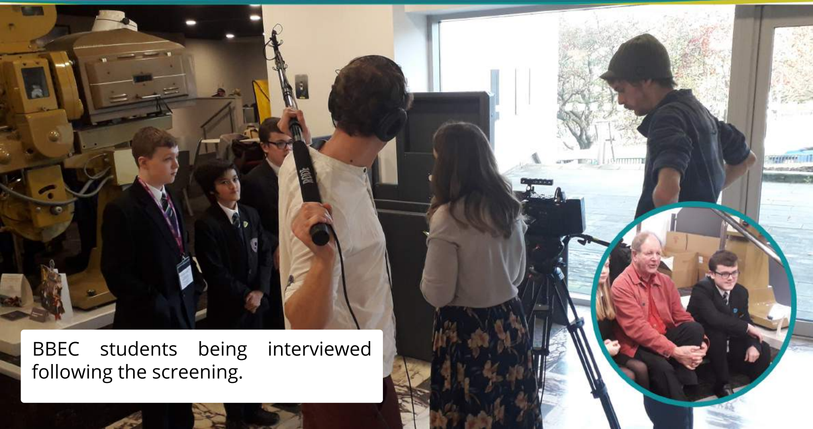
BBEC students being interviewed following the screening.